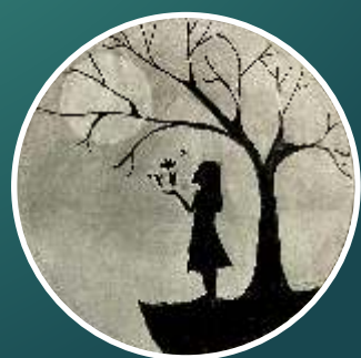
Dev Kamthe, VII-B