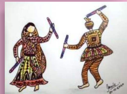
Chinmay Gawde, VIII-A