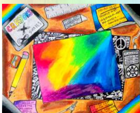
Vidhi Chand, IX-G